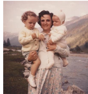
St. Gianna Beretta Molla (1922-1962)